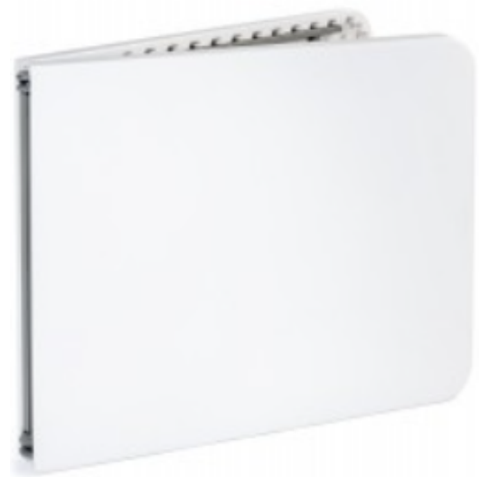
Fold in Half Table